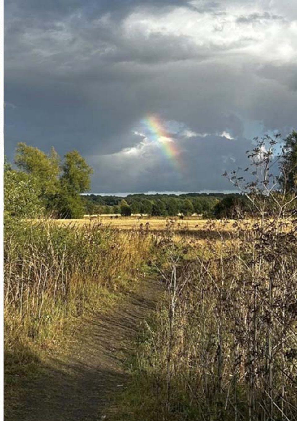
Members of the United States Air Force laid a wreath, a rainbow appeared over Court Knoll