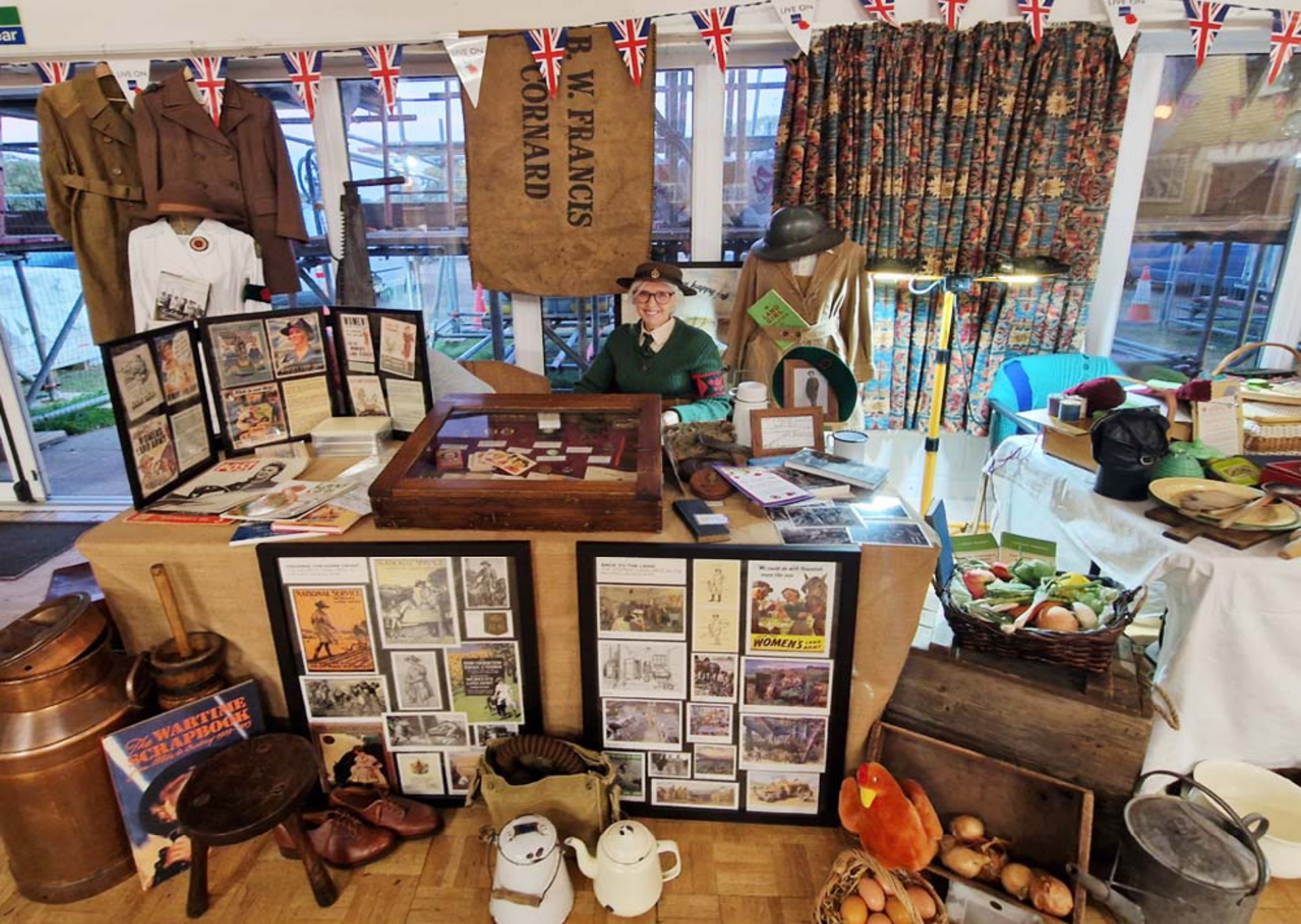
There was an interesting display by the Land Army Girls