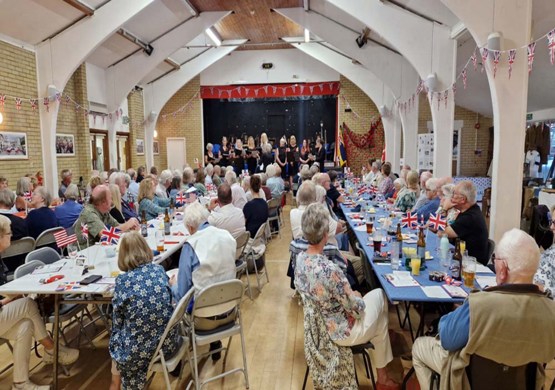
The Wattisham Military Wives Choirs