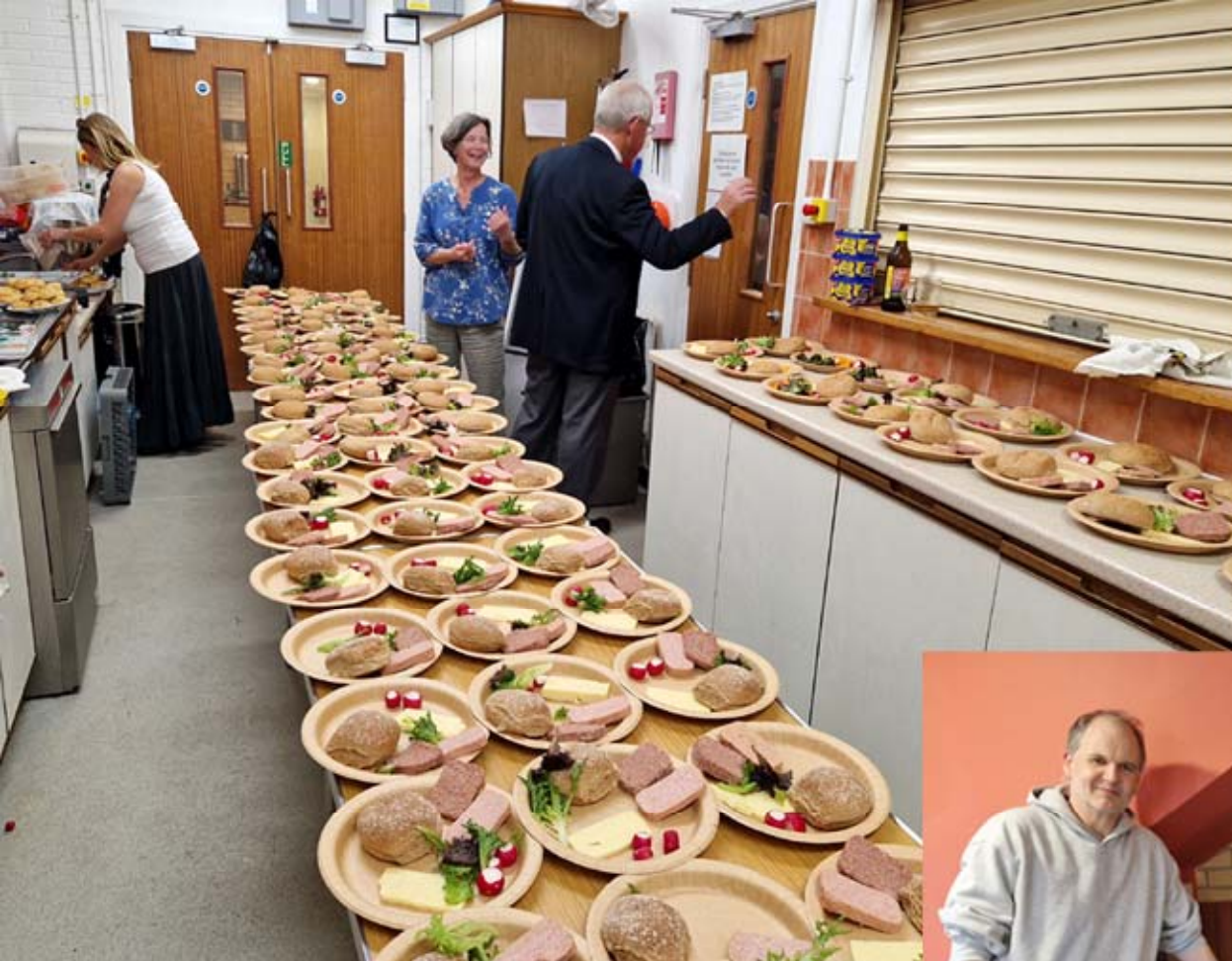
Behind the Scenes

Keeping everyone fed and watered – there was no rationing at the bar!