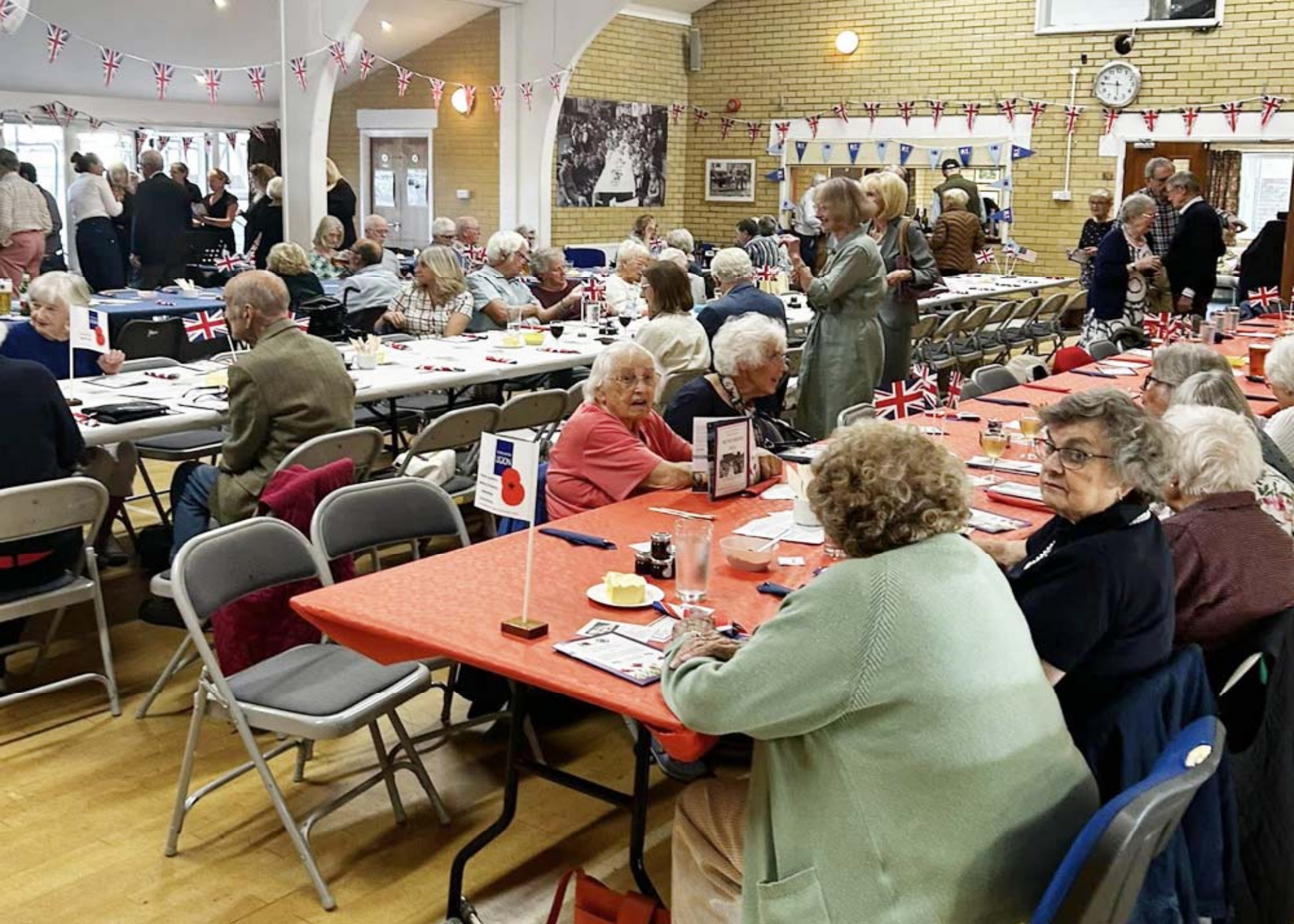
The doors are open