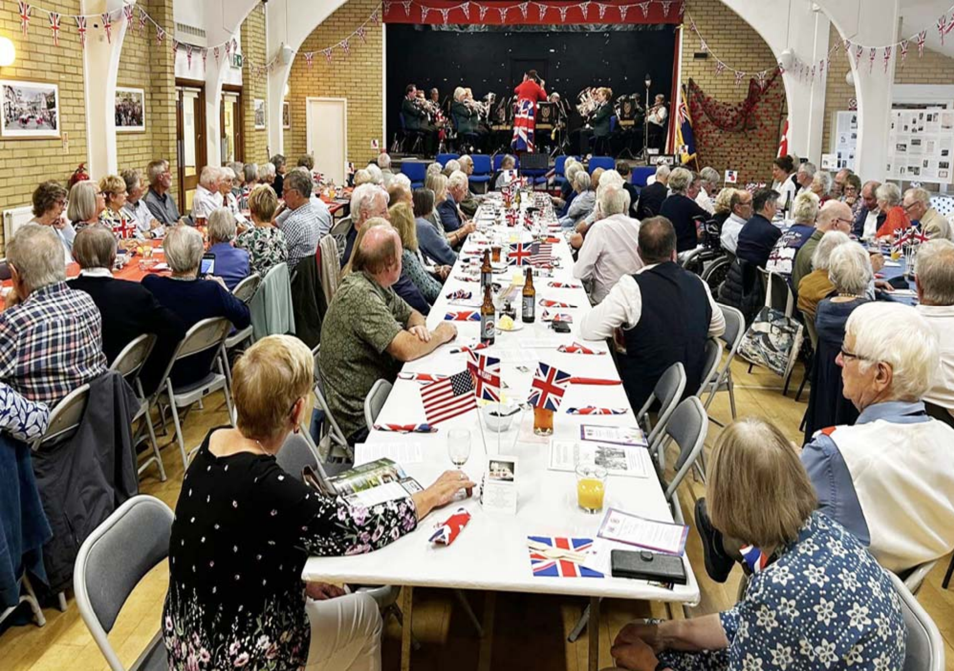
The Breckland Brass Band