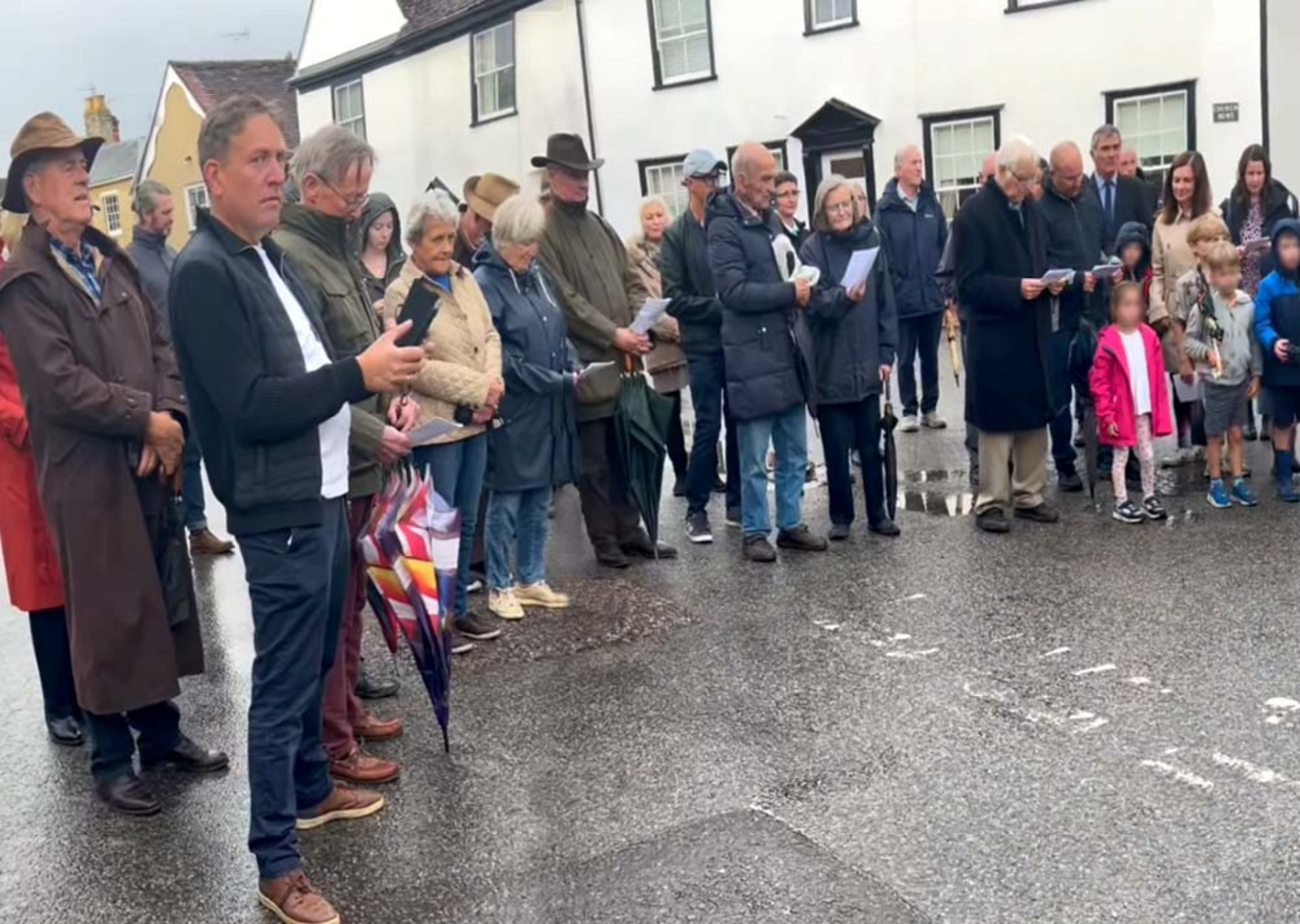
Villagers braved the weather to pay their respects