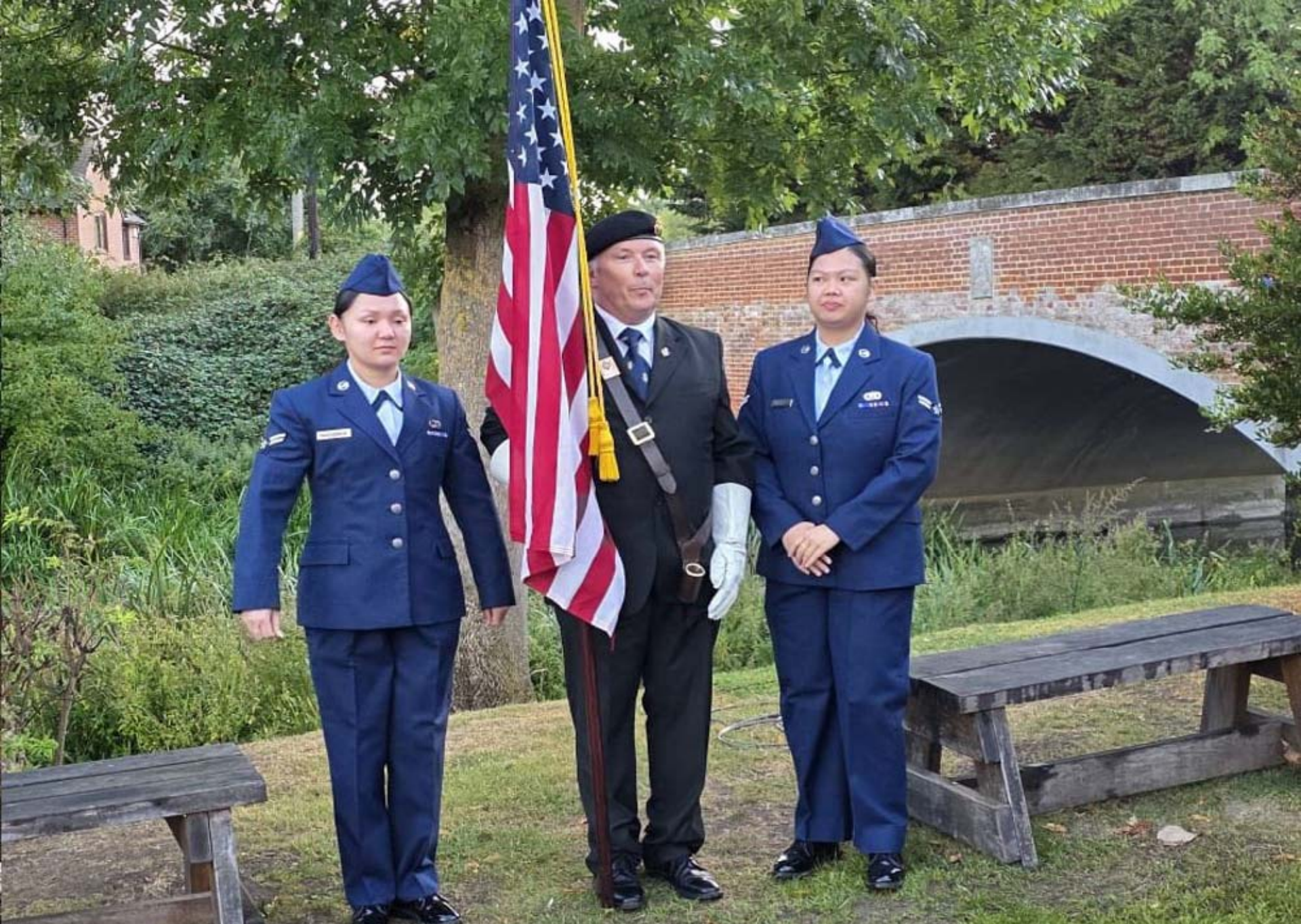
The evening concluded at The Anchor Inn sharing memories and a British pint with our American visitors