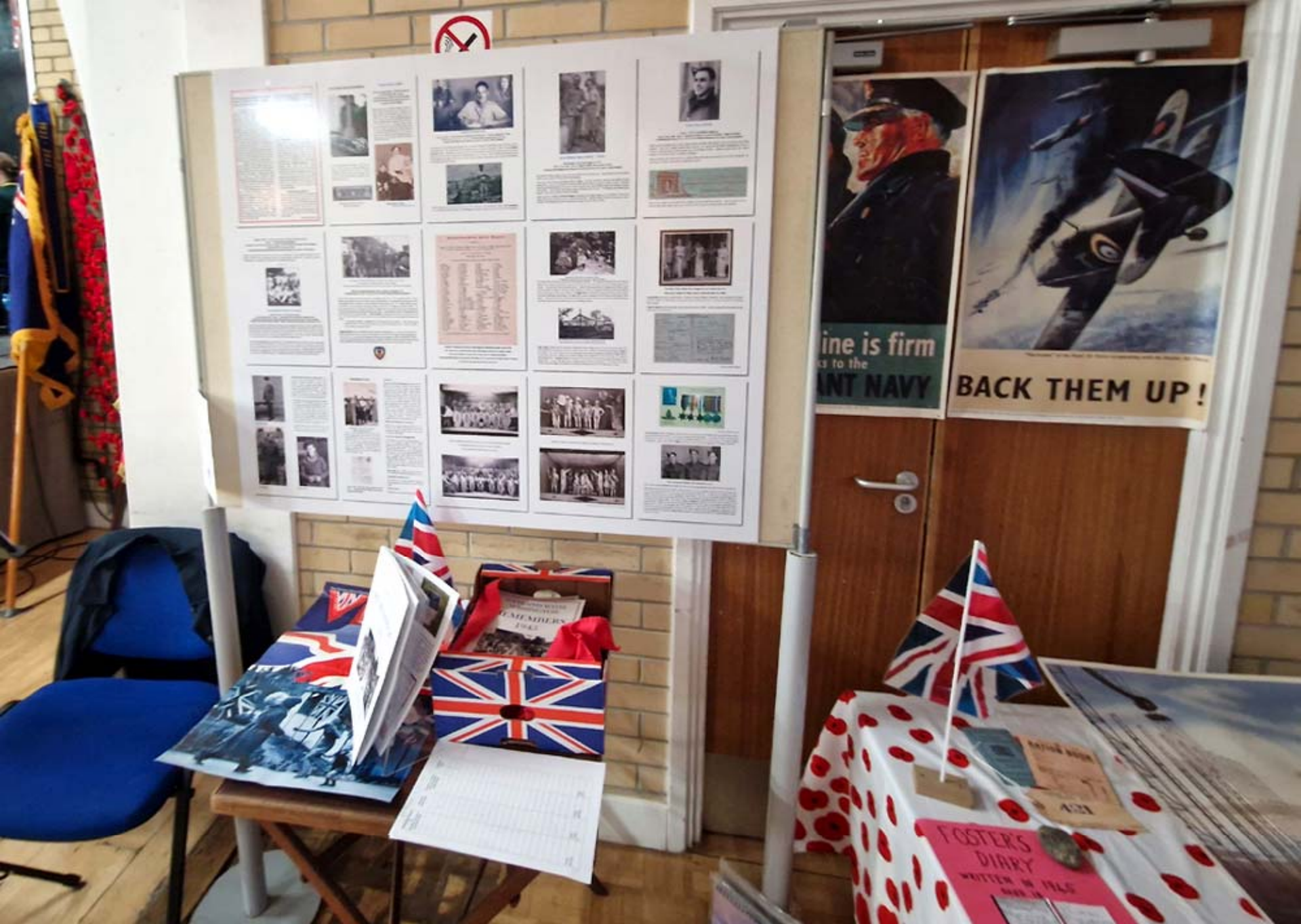
A display of local WW2 memorabilia and the 'Remembers 1945' book